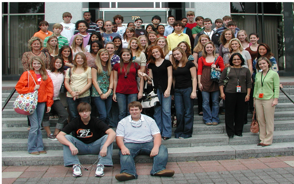
HOOVER HIGH SCHOOL FINANCE ACADEMY VISIT THE ALABAMA SECURITIES COM- MISSION (OCTOBER 16, 2007)

High School students and teachers from all over Alabama visit the Commission at no cost other than to provide their own transportation and lunch. Typical field trips last about four hours and include over two hours of investor education and information about how ASC regulates the securities industry in the state of Alabama. The Commission will tailor Field Trip visits to the teacher's lesson plan and objectives. Sometimes the Commission provides professional Special Agents and Analysts to talk about their profession and how they achieved their position for career education. On many occasions a guided tour of the State Capitol is included during the visit.. High School teachers may call 1-800-222-1253 and ask for the Education and Public Affairs Office to schedule a tailor made field trip.