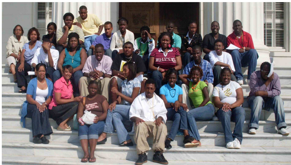
THE WILLIAMSON HIGH SCHOOL BUSINESS AND FI- NANCE ACADEMY (MOBILE) VISIT THE ALABAMA SECURITIES COM- MISSION SEPTEM- BER 29, 2008.

High School students and teachers from all over Alabama visit the Commission at no cost other than to provide their own transportation and lunch. Typical field trips last about four hours and include over two hours of investor education and information about how ASC regulates the securities industry in the state of Alabama. The Commission will tailor Field Trip visits to the teacher's lesson plan and objectives. Sometimes the Commission provides professional Special Agents and Analysts to talk about their profession and how they achieved their position for career education. On many occasions a guided tour of the State Capitol is included during the visit.. High School teachers may call 1-800-222-1253 and ask for the Education and Public Affairs Office to schedule a tailor made field trip.