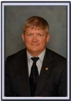
Senator Greg Albritton

The new law is narrowly tailored to specifically address fraudulent conduct that results in theft committed by fraudsters who deceive victim(s) in a long-term scheme for amounts of $100,000 or more from public funds (derived from taxpayers of Alabama) or $200,000 or more of individual or business funds. The bill focuses on theft of cash and cash equivalents such as investments, trust accounts and nest egg accounts. The Aggravated Theft by Deception Law is specifically written to grant prosecutors greater ability to obtain repayment of restitution for the victims of such fraudulent schemes. The new statute of limitations allows prosecution of the crime for up to six years from the time that the theft is discovered. The new law will assist in preventing fraudsters from escaping prosecution from a well-executed scheme that may take years to discover. Additionally, the period of probation is extended from 5 years to 10 years in order to address restitution to victims. The law is intended to address complex