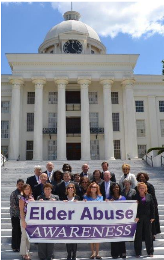
Sixth Annual World Elder Abuse Awareness Campaign kick-off on the steps of the State Capitol.

During FY 2014, ASC's Education and Public Affairs Division continued its successful and informative outreach program to promote effective financial, investor, and fraud protection education to teens, working adults and seniors. Of major importance during this fiscal year was the provision of investor and fraud prevention education to Alabama citizens aged 50 and above. Seniors in the United States and Alabama are prime targets for financial fraud as they hold an estimated $14-20 trillion in assets. The ASC has joined with the Alabama Attorney General's Office, the Alabama Department of Senior Services, the Department of Human Resources, and many other state agencies (many supporters from these agencies are shown in photo at left) to conduct outreach events throughout Alabama and to help draft and promote the passage of new legislation to protect senior Alabamians against financial victimization. The Education and Public Affairs Division sets a high bar for the development and delivery of practical, insightful information that serves as a first line of defense against financial crimes that can devastate senior Alabamians' long-term financial independence. The following paragraphs illustrate the division's continued close collaboration with senior advocacy groups, law enforcement, business and others to promote investor education and fraud prevention during the past fiscal year.