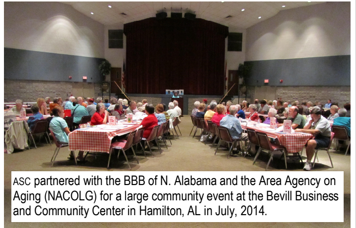
ASC partnered with the BBB of N. Alabama and the Area Agency on Aging (NACOLG) for a large community event at the Beville Business and Community Center in Hamilton, AL in July, 2014.

Fraud prevention events were organized around expert panels, many consisting of representatives from the BBB of North Alabama; the Alabama Securities Commission; the Alabama Attorney General Consumer Affairs Division; the U.S. Postal Inspection Service; U.S. Federal Trade Commission; local financial institutions, local law enforcement agencies, and others. Representatives of each agency spoke of their respective fields of expertise, their responsibilities and how their agencies worked cooperatively to combat consumer fraud and other financial crimes that target Alabama’s citizens. Topics included insightful information by panel members about offers of potentially unsuitable investment “opportunities,” frauds associated with unregistered investment offerings, lottery and sweepstakes schemes, the warning signs of financial fraud, and suspicious and illegal offerings through the U.S. mail, among others. Panel members fielded a variety of questions from audience members about issues of particular concern and how best to thwart illegal tactics used by con artists who might attempt to victimize them, either in person, via email, phone or through social media. Panel representatives also provided, free of charge, a wealth of printed educational material for consumers’ reference and use.